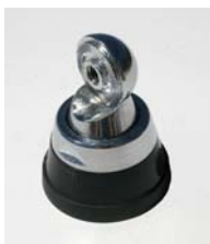
Zara base & cable complete. 90° Mounting option available.